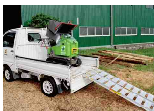
Able to load on a light truck or trailer