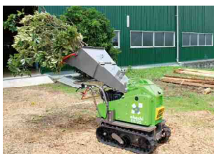
Leafy branches OK