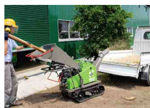
Long High Shooter