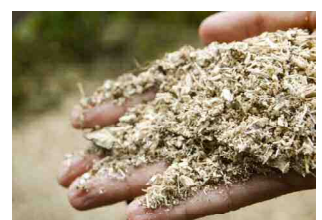
Chips of approx. 5 mm